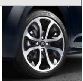
17" Clover Alloys Spare: Space Saver STANDARD ON EXCLUSIVE