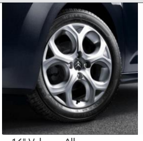
16" Valonga Alloys Spare: Space Saver STANDARD ON SEDUCTION AUTOMATIC